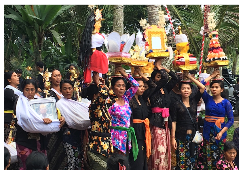
Fig 7. Villagers carrying ashes and offerings, waiting for the procession to the nearby creek, Tingkadbatu.

The ceremony of ngaben is not the only ritual event whose occurring comes to intersect with the peak holiday season in Gregorian calendars. As mentioned, July and August are the time when many auspicious dates in Balinese calendars happen. In Tingkadbatu village, the ceremony of mepandes (tooth-filing ceremony) is usually held together with the ngaben for the auspicious purpose. Three days after the ceremony of cremation was held, villagers in Tingkadbatu were gathering together at the banjar for the following "mepandes". In the banjar, mattresses were set waiting for those who would undergo their tooth-filing. A grand purification ritual ensued at night after the mepandes was performed. It was like a village gathering and feast. The banjar was transformed into a grand stage surrounded with offerings towering with delicately made dough figures. Kids dressed up in costumes and performed the dance that aims to please the high spirits. Actors and actresses were invited from Bangli to perform dramas. The entire yard of the banjar was packed with villagers,