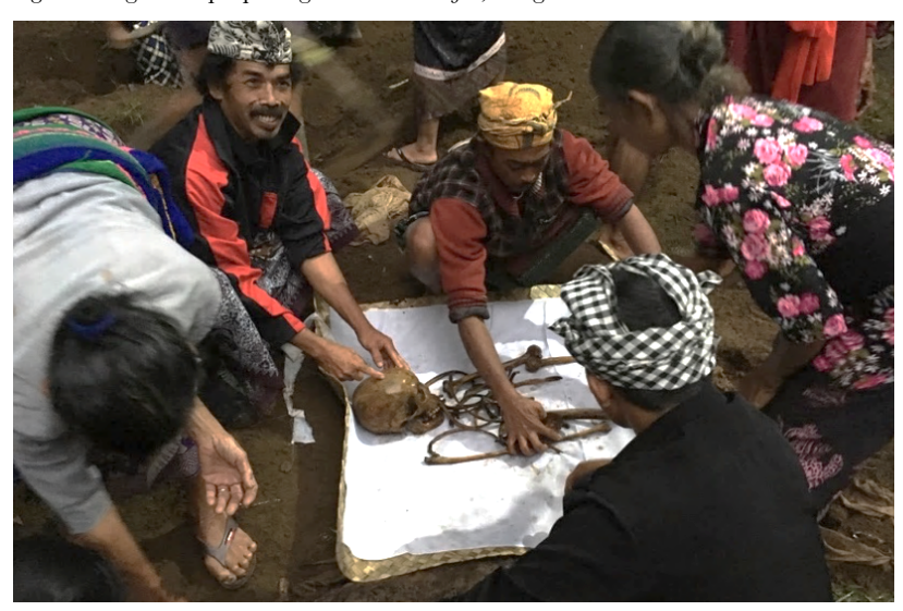
Fig 4. Excavating remains of the deceased in the morning on the day of cremation, Tingkadbatu.