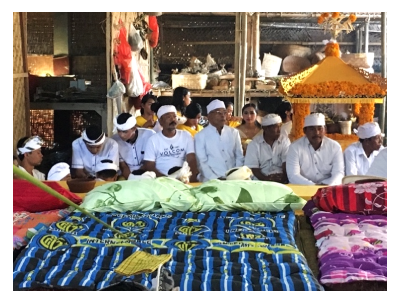
Fig 9. In the banjar, villagers waiting for the beginning of tooth-filling ritual, Tingkadbatu.