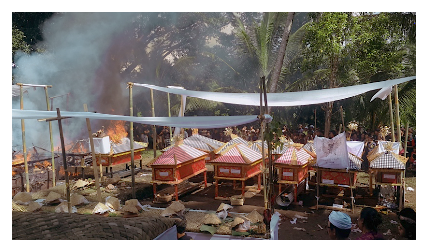
Fig 5. The climax of the ngaben: cremation process in the cemetery, Tingkadbatu.