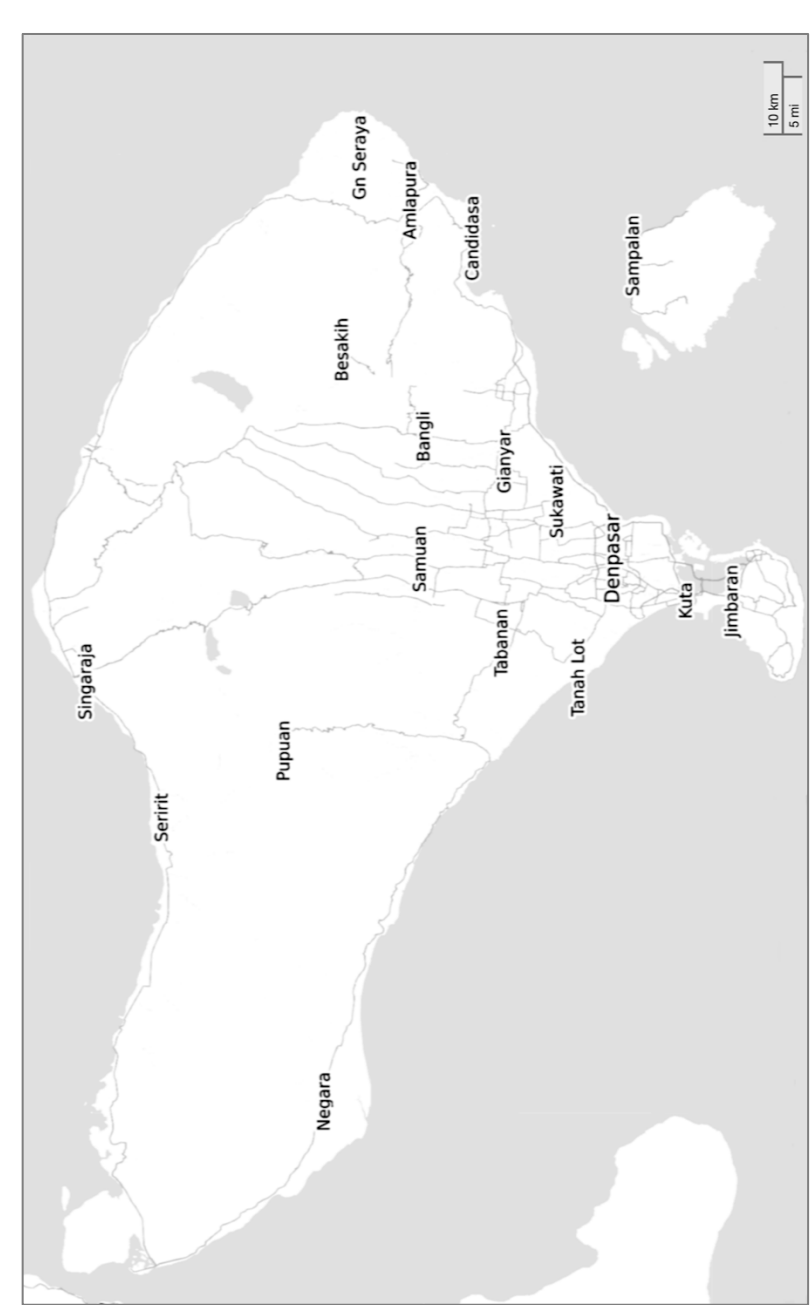
Map 1. Bali Island.