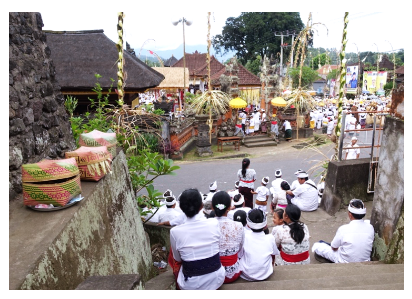
Fig 16. 'Ngerupuk', purification ceremony on the eve of nyepi, Sibetan.