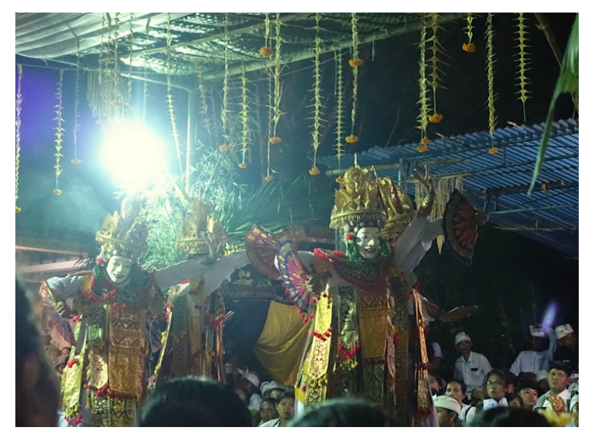
Fig 13. The dance performance for the ngenteg linggih, Kerobokan.