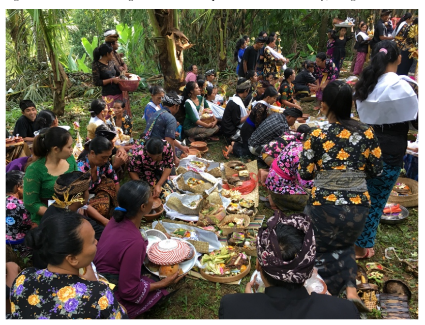
Fig. 6. Family members of the deceased praying in the cemetery, Tingkadbatu.