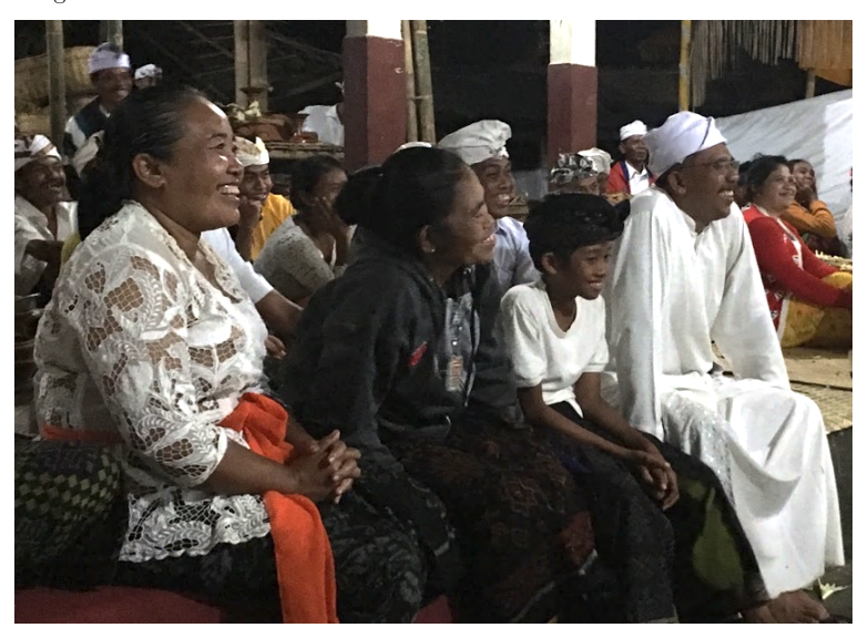
Fig 10. Villagers enjoying the drama and dance performance at the night festival ensuing the ritual of tooth-filing in banjar, Tingkadbatu.