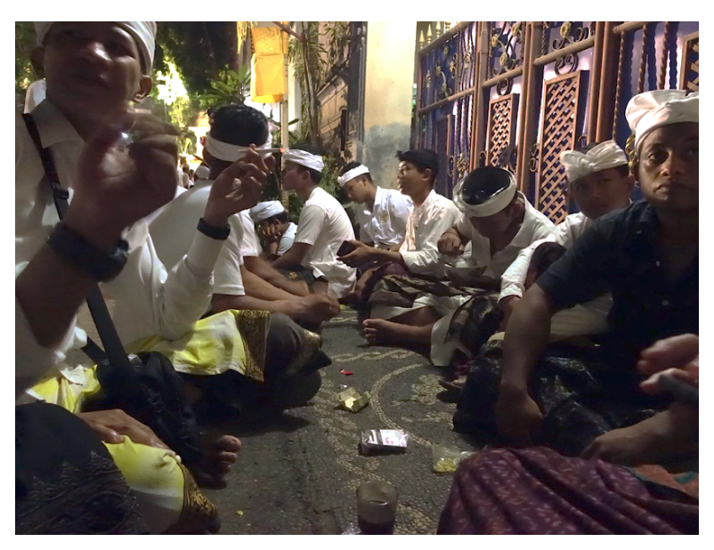
Fig 14. Young men of Demulih village playing cards and smoking while waiting for the ceremony of Buda-Wage outside the temple, Bebalang, Bangli.

Yet, it was precisely his belief that waiting embodies a form of sacrifice that have both added weight to a sense of obligation, and at the same time consolidated his anxiety and shame when he failed to join the ceremony.