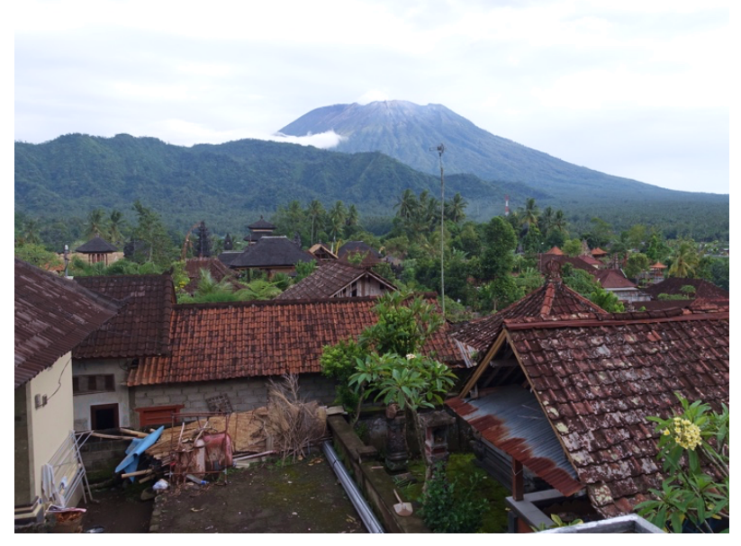
Fig 17. View of Mount Agung from the house of Surata Wayan, Sibetan.