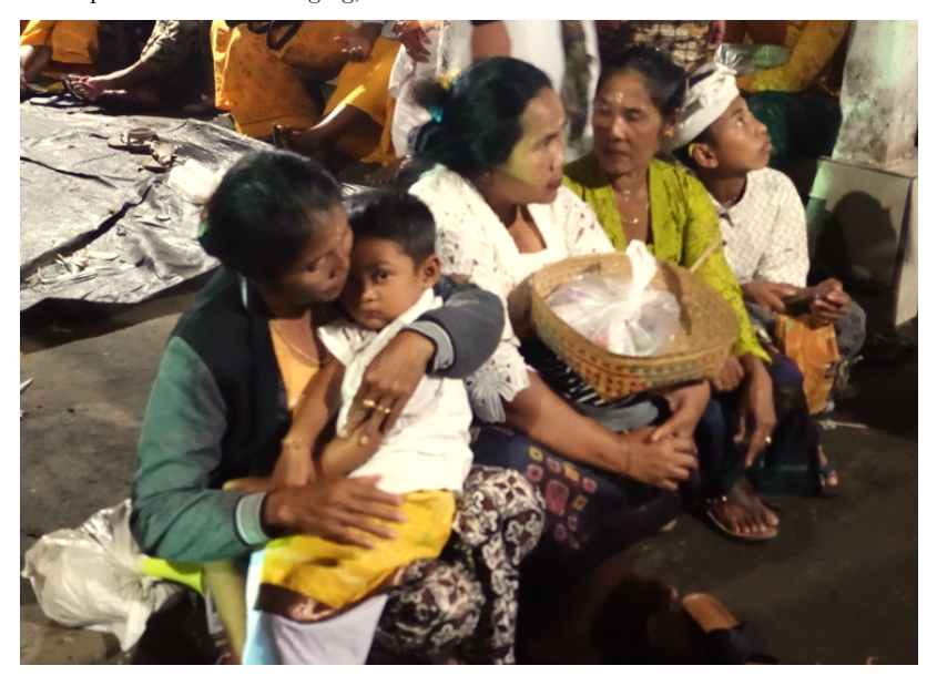
Fig 12. Women taking care of their kids and resting inside the temple, Kerobokan.