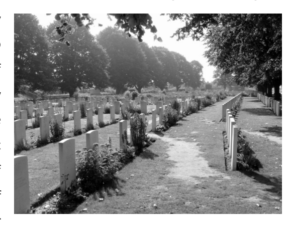
Figure 2: British Cemetery by Ypres

fallen, was a practise which originated in the army and was used to acknowledge that all those who had lost their lives during the war were worthy of personal attention (Laqueur, 1994). A new development following World War One was the omission of the military ranks, according to Alex King this was taken to connote the equality of sacrifice. The fallen had achieved an equal level of moral achievement which transcended all other differences (1998, p. 187). Thomas W. Laqueur