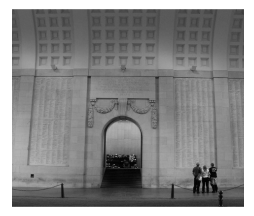
Figure 6: Interior of the Menin Gate

dooden opgericht wordt aan de burgers van Yper geschonken tot versiering van hunne stad en