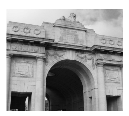
Figure 5: The Menin Gate facing the former battle fields

in Ypres Salient but to whom the fortune of war denied the known and honoured burial given to their comrades in death.' The text above the opposite staircase is complementary and reads as follows: 'They shall receive a crown of glory that fadeth not away'. The pillars, the reverse side of the Doric columns in the facade, on the side of the market square are likewise inscribed with short texts: 'This memorial was built and is maintained by the Commonwealth War Graves Commission'; 'Deze Poort door de stammen van het Britsche Rijk ter eere van hun