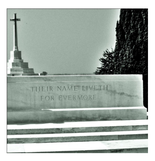
Figure 3: Cross of Sacrifice & Stone of Remembrance

The overall design of the cemeteries seemed to refer to a churchyard emphasising the link with nature (Mosse, 1990, p. 93) and attempted to transcend the horror of war by creating a 'foreign field that is forever England' (Brooke, 1914, p. 15). This feeling of timelessness, of permanence was deliberately evoked. In the planning documents it becomes clear that the