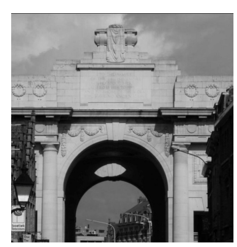
Figure 4: The Menin Gate facing Ypres

The monument is 25 meters high, 31 meters wide and 42 meters long (Meire, 2003), its exterior facades are faced with red brick and Portland stone. It has three